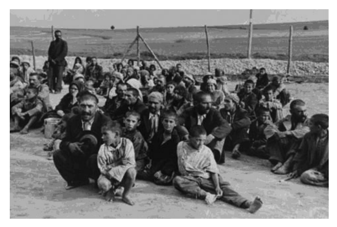
Photo: 2 A group of Gypsy prisoners, awaiting instructions from their German captors, sit in an open area near the fence in the Belzec concentration camp, circa 1940.

many popular books on gypsy magick and culture however, present information through rose colored glasses. Most of the time, these serious issues are never even mentioned! People either write superficial descriptions of gypsy culture, or just present information about magick, much of which is not even gypsy in origin. I, on the other hand, feel it is important to raise awareness of the ongoing struggles of the Romani people. To simply make a list of spells and quotes would be utterly disrespectful. As the popular saying goes, "You can't change what you don't acknowledge." At least, if we acknowledge the historical and contemporary truth, we can be part of the solution. Thus, it is in the spirit of honor and celebration of the Romani people that this book is written.