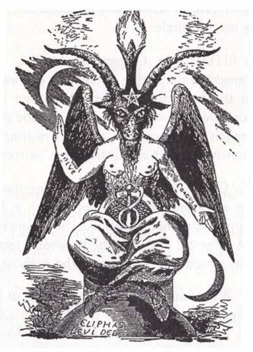
Eliphas Levi's famous drawing of the mysterious deity known as Baphomet, 1861.

BASKANION A phallus-shaped ornament worn on a necklace by children of ancient Greece for magickal protection against the evil eye. The baskanion (which was also known as probaskan ion and fascinum ) was often used as an amulet to protect homes, gardens, blacksmith forges, and chariots. In ancient Rome, this amulet was called the satyrica sigma .