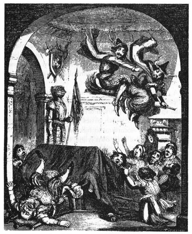
In olden times, the subbing of special "flying ointments" upon the body was believed to give a Witch and her broomstick the power of flight.

bizarre stories of demonic, orgiastic Sabbats which Witches supposedly flew off in the night on broomsticks to attend, in all probability were nothing more than hallucinatory delusions brought on by the mind-altering components of the flying ointment.