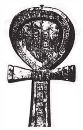
The ancient Egyptian symbol of the ankh.

AN-SHET Another word for a Witch's magick wand.