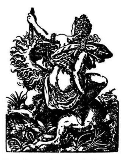
According to legend, only the pure touch of a virgin can tame a wild unicorn.

UNICORN A fabled creature in folk legend and heraldry, represented as a gentle, horselike beast with a single spiraled horn extending from its forehead, and often with a lion's tail and a goat's beard. The unicorn symbolized chastity, virginity, fierce-