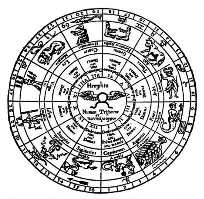
A seventeenth-century engraving showing the Latin, Greek, and Egyptian versions of the zodiac. From Oedipus Aegyptiacus by A. Kircher, 1653.

HOROSCOPE In astrology, a chart of the heavenly bodies that shows the relative positions of the planets at a certain moment in time. Given the exact time and place of an individual's birth, an astrologer can cast a horoscope from which to define the subject's character and advise them on future courses of action.