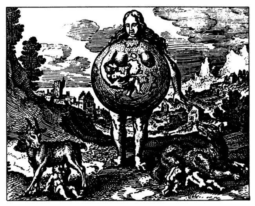
The Goddess as creatrix.

ity; however, in Neo-Paganism and the Craft of Wicca, the most popular goddess who represents the Crone is the Greek lunar goddess Hecate. See also MAIDEN, MOTHER, and TRIPLE GODDESS.