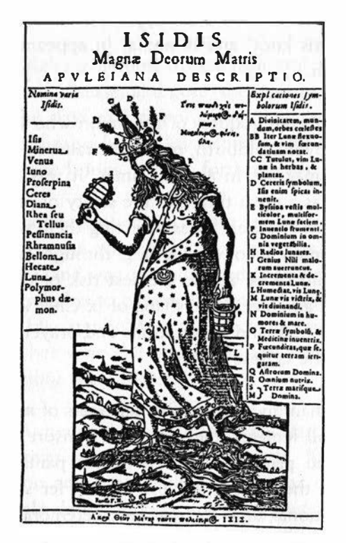
Athanasius Kircher's mid-seventeenth century depiction of the Egyptian goddess Isis. From Oedipus Aegyptiacus, 1652.

ISIS An ancient Egyptian goddess of fertility who was also associated with magick and enchantment. In Egyptian mythol-