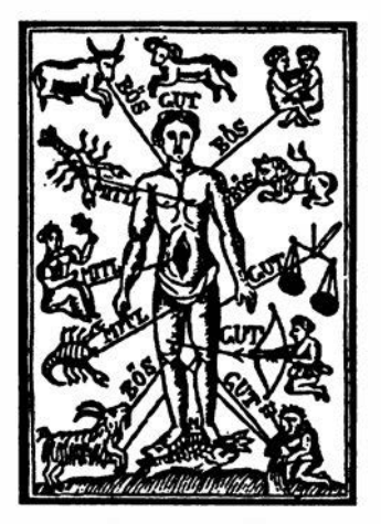
A nineteenth-century illustration shows the relationship between the twelve astrological signs of the zodiac and different parts of the human anatomy.

ZOOMORPHISM The ability to change from human to animal form (or vice versa) by means of charms, magickal incantations, or supernatural powers. The most common forms of zoomorphism are: aeluranthropy (human to cat), boanthropy (human to cow or bull), cynanthropy (human to dog), lepanthropy (human to rabbit or hare), and lycanthropy (human to wolf). Human to animal transformations (as well as animal to human) have been performed since ancient times by sorcerers in nearly every part of the world, especially South America, Africa, and Haiti. See also SHAPESHIFTING.