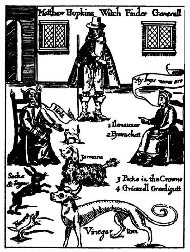
Witches and their imps (familiars). From Matthew Hopkins's Discovery of Witches, 1647.

the intent of the spellcaster. In order to be effective, an incantation must be done during the correct lunar phase ( See also MOON) and accompanied by a visualization of the intent and the raising-directing-releasing of magickal energy. Not all Witches recite incantations when spellcasting; however, the majority of