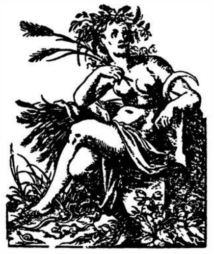
The Roman goddess Ceres.

CERES A Roman goddess of harvest and fertility, and also a mother goddess. According to mythology, during the Winter